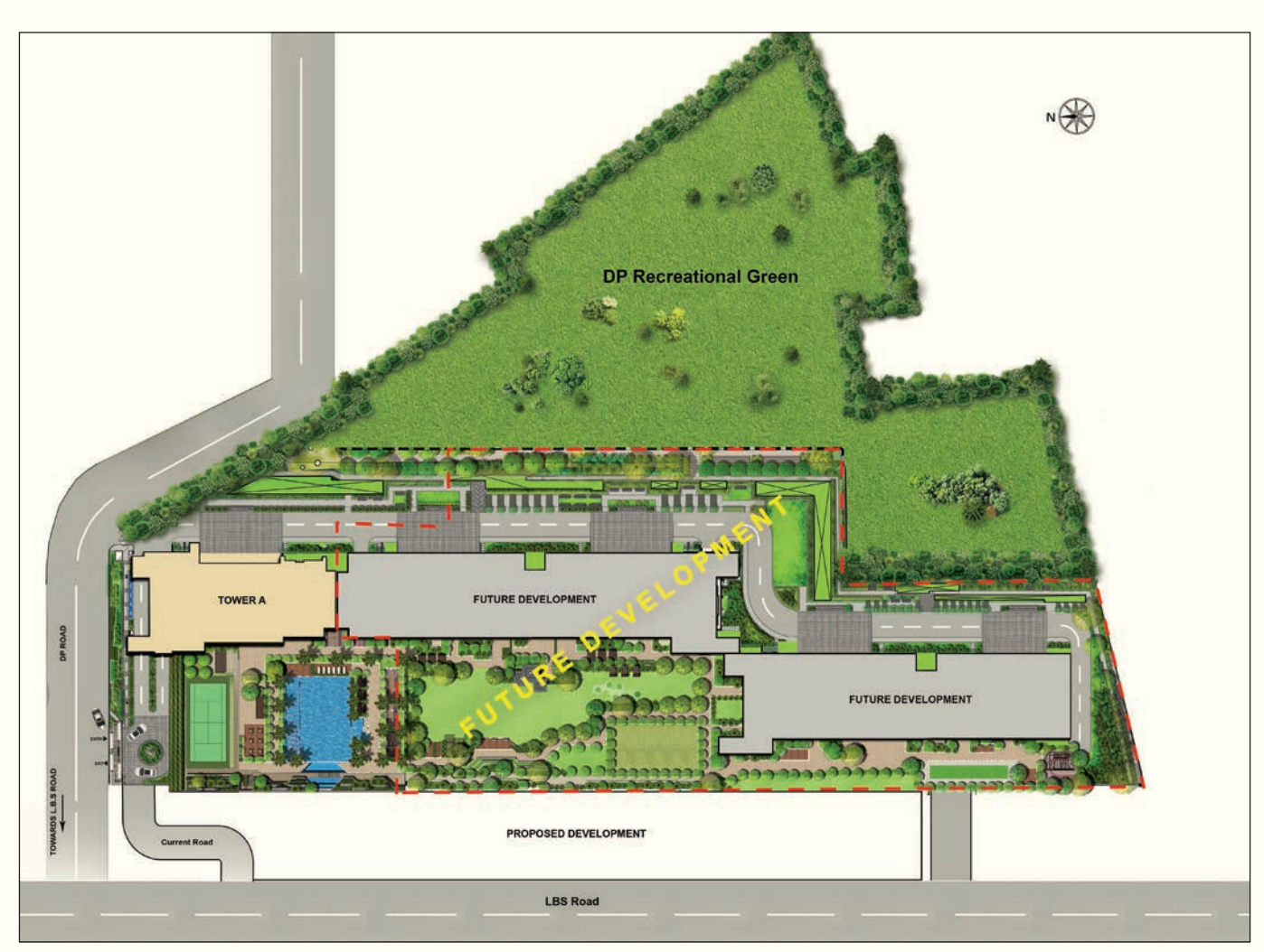
The image is purely for representation purpose only. The part of development enclosed in red dotted line is proposed future development and may be subject to change as per developer's discretion. The location of various structures / developments within the shown project are subject to change. DP Recreational Green is not part of the project.

Nearly 90% of the apartments are either east or west facing, which ensures that the rooms are flushed with sunlight and remain well ventilated. This also ensures that you get to soak in the tranquil views of the hills on one side and creek on the other.